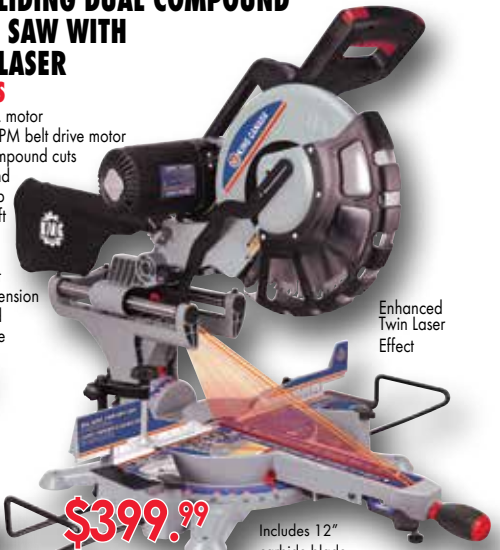
Enhanced Twin Laser Effect