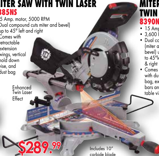
Enhanced Twin Laser Effect