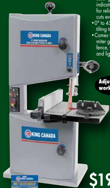
Adjustable work light