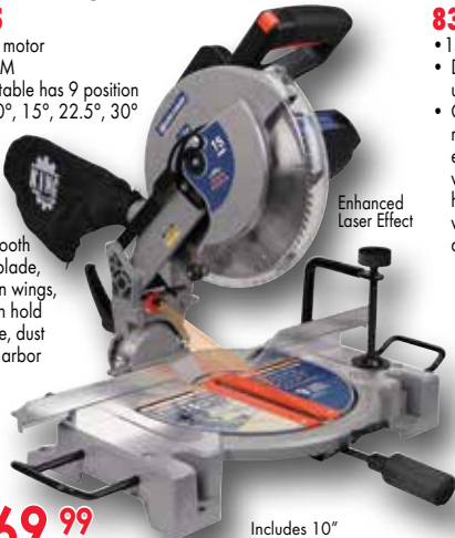
Enhanced Laser Effect